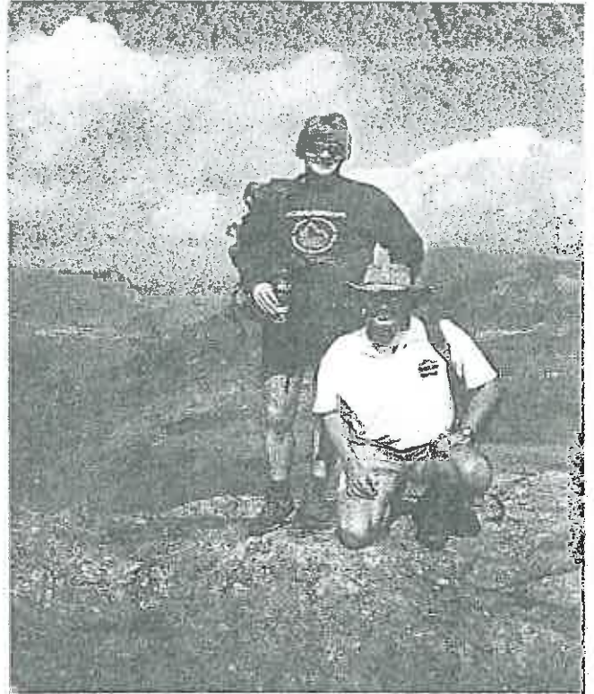
As can be seen these two so called runners kept up the Lestock tradition by posing all the time they were away in Borrowdale.